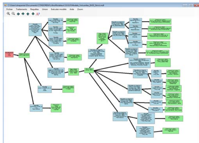
Sample processing model example based on the geochemical classification of IUGS volcanic rocks.

Another significant improvement in version 3.0 is the ability to create automatic processing models. The idea is to create automatically and sequentially a series of more or less complex preprogrammed processing models. All Lithomodeleur calculations can be included in the models: indices, diagrams, norms, queries, etc. The models are constructed using an intuitive graphic interface. Version 3.0 includes three predefined models. It is easy for users to create their own models according to their specific needs.